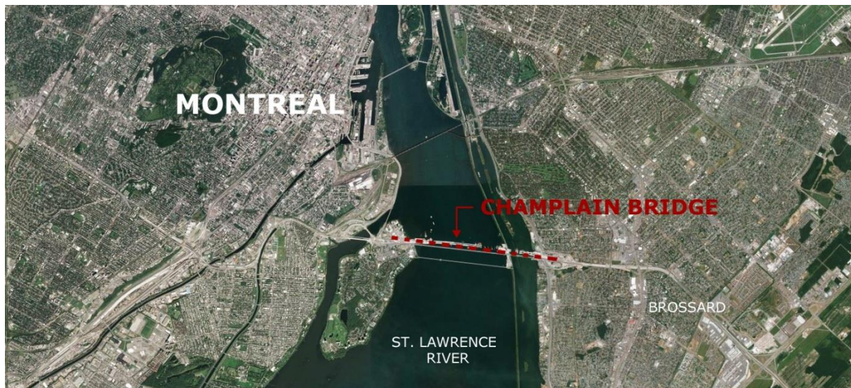
Fig. 1. Location of Champlain Bridge

The Champlain Bridge crosses the St Lawrence River and connects Montreal to the South Shore and its surrounding area. The bridge, suffering from premature degradation, was shut down for traffic on June 28, 2019, after completing a replacement bridge 100 m downstream. Carrying an estimated 50 million annual trips and Can $ 20 billion in trade, during the 57 years of its operation, the Champlain Bridge was one of Canada's busiest bridges and the main gateway from points east to the continental corridor. The demolition of the bridge will begin in mid-2020 and is estimated to last three years. It is expected to cost around Can$225 million.