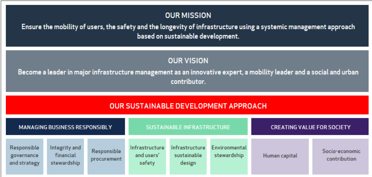
Fig.4. JCCBI mission, vision, and sustainability strategy