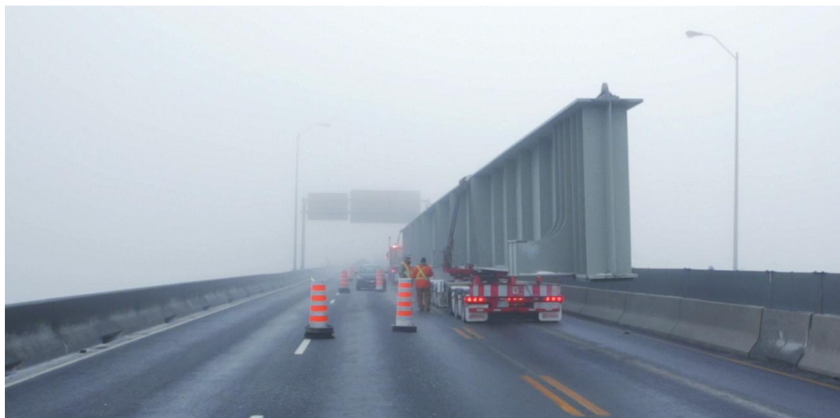
Fig.5. Installation of the “super beam,” November 2013

In early November 2013, an emergency further justified the decision to replace the bridge. The sensors installed by JCCBI on the edge girders of the bridge monitoring every little crack, started sending unusual deformations. In late November 2013, the bridge had to close entirely, and a 75-tonne, 56-meter steel support beam was installed to reinforce a cracked girder, called by the media, the “super beam.” The “super beam” was installed above the weakened edge girder and reduced the bridge's traffic capacity by one lane. Normal traffic resumed five months later when the “super beam” was removed and replaced with permanent modular trusses installed underneath the edge girder. Before and following that incident, there was a series of interventions on the bridge to install new queen posts and steel beams under each of the bridge’s edge girders that are still visible today.