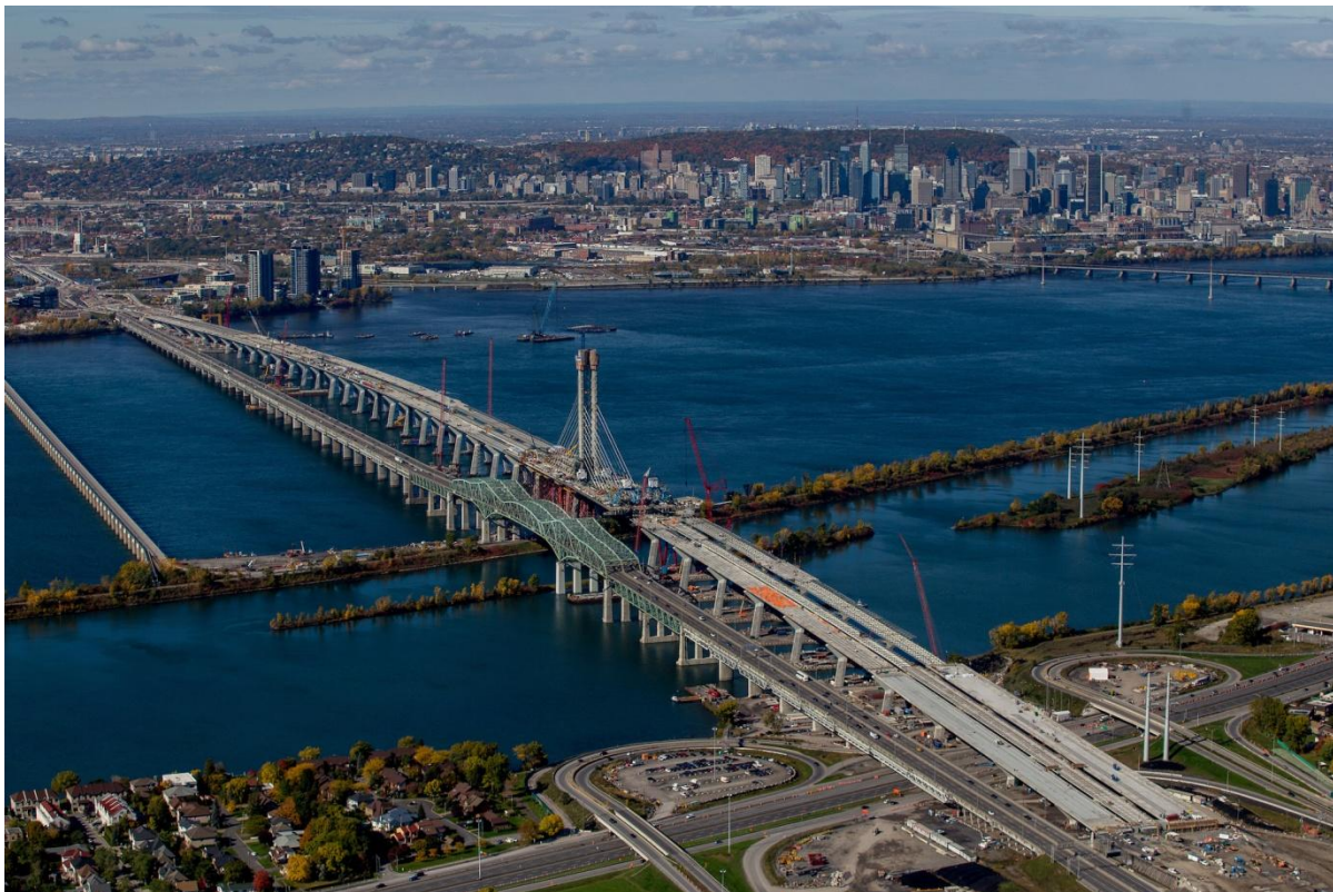
Fig. 6. The new Samuel De Champlain Bridge during construction

The new Samuel De Champlain Bridge construction began in 2015, and it was completed four years later, with traffic rerouted from the old to the new bridge on July 1, 2019. The new cable-stayed bridge is located 100 m downstream from the old bridge (Fig. 6). It was built under a public-private partnership agreement, and Signature on the Saint Lawrence Group (SSL) will operate and maintain it for 30 years. The new cable-stayed bridge carries four lanes of motor traffic in each direction, including one lane reserved for buses. A separate bike path with a pedestrian strip runs along the bridge's north side, with a few observation decks for rest and views of Montreal's skyline. A central mass transit corridor is still under construction and used by a light rail system (LRT) to be completed in 2021.