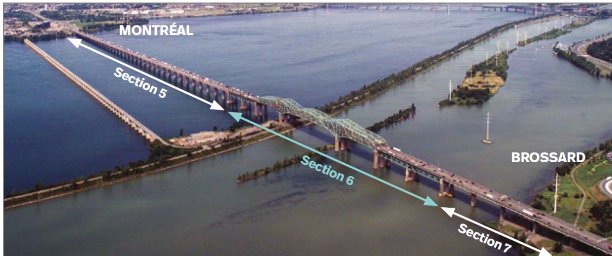
Fig. 2. The three sections of Champlain Bridge