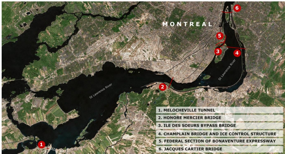
Fig.3. Assets managed by JCCBI

In the last ten years, JCCBI has grown from 50 employees to almost 200 people and has expanded its activities. In the last decade, the focus on engineering and maintenance of the JCCBI assets is enhanced to integrate sustainability and the projects' environmental and social benefits. Future projects include the development of public spaces on land managed by JCCBI. In parallel, there are efforts to implement the best governance for these lands, while maintaining good relations with the community stakeholders and involve them as much and as early as feasible in the process.